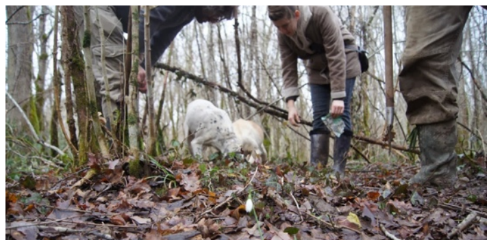
Did we found a Truffle? - this time just snowdrop. Do you see it?

To experience the adventure of truffle hunting, you will be able to accompany licensed truffle hunters and their trained dogs as they weave their way through the woods in a game of hide and seek for truffles.