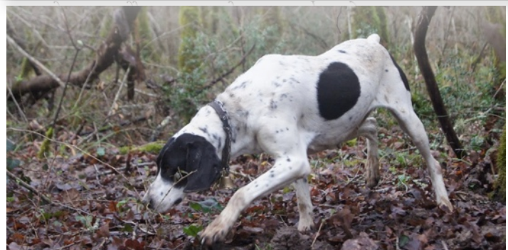
Hardworking and talented Nela is working! Oops, sniffing ...