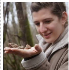
The trophies: white truffles!